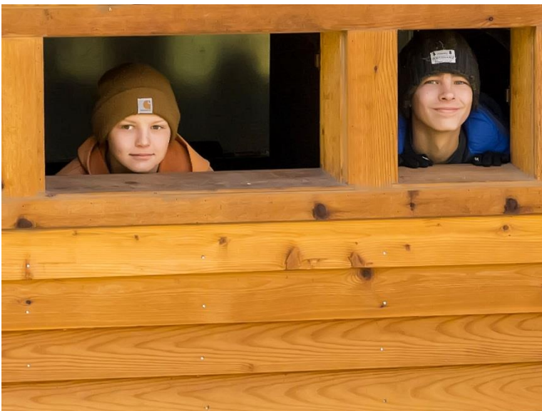
Image 2: Two field trip participants look out of the bird blind during a program in 2015.