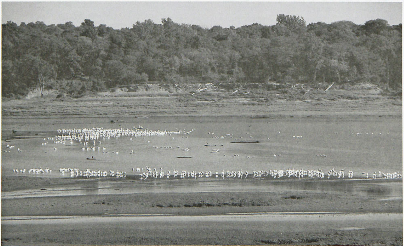
American White Pelicans at Jester Park, Saylorville Lake, Iowa.

Wildlife officials have considered diseases, food supply,