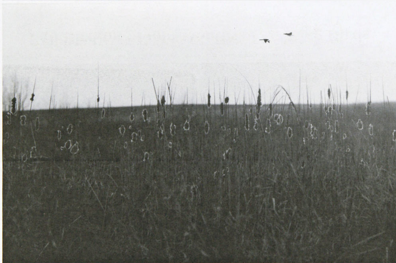
Two Canada Geese fly low over the Union Hills Wildlife Management Area of Cerro Gordo County.