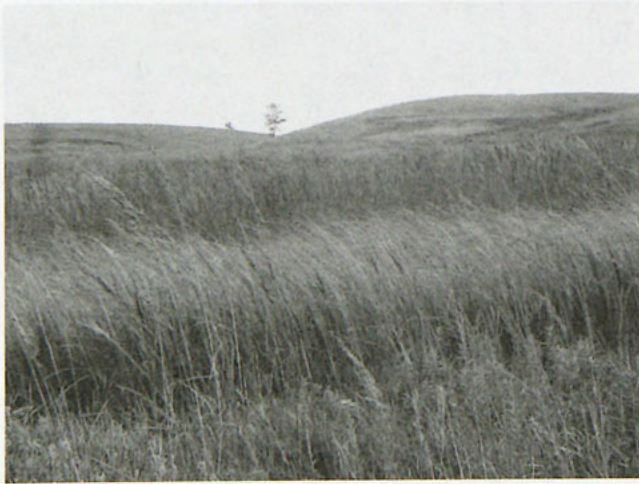
The dominant prairie in Iowa is tallgrass, which is not preferred by Smith's Longspur. The restored area shown in the photo is part of the Union Hills complex in Cerro Gordo County.

The Birds of North America account gives a population estimate of <75,000 Smith's Longspurs in North America (Briskie, 1993), but the majority of them likely migrate through Iowa in spring and fall. While most Smith's pass over the bare dirt fields of Iowa, more should be discovered in our state, considering they once wintered in southern Iowa before the plowing of the original prairie. Smith's core migration and wintering range in the U.S. seems intrinsically tied to the historical Tallgrass Prairie Region, although the birds really don't like tall grass. Traditionally, field guides suggested searching areas such as airports, mowed pastures, and weedy crop-stubble fields, but these haven't proven very fruitful in Iowa. Historically however, Smith's favored short-grass areas amid tallgrass prairie, areas such as recently spring-flooded ground, and the perimeter of drying fall wetlands. Perhaps they once enjoyed swaths of devastation caused by bison? Based on this "natural habitat" profile, I propose a method for finding Smith's Longspurs all across Iowa.