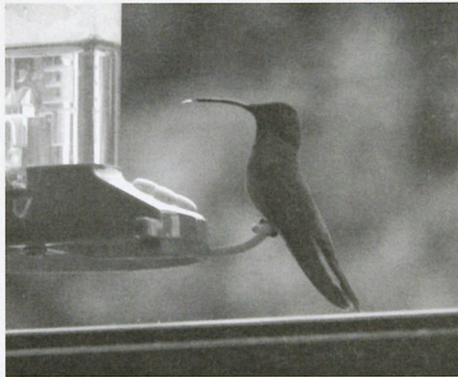
A Green Violet-ear appeared at the Neher's feeder in September 2005.

pass through in October, and Long-eared and Saw-whet Owls arrive to spend the winter, along with species like Northern Shrikes and Snow Buntings.