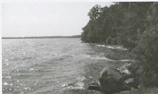
There is very little pristine shoreline remaining at Spirit Lake.