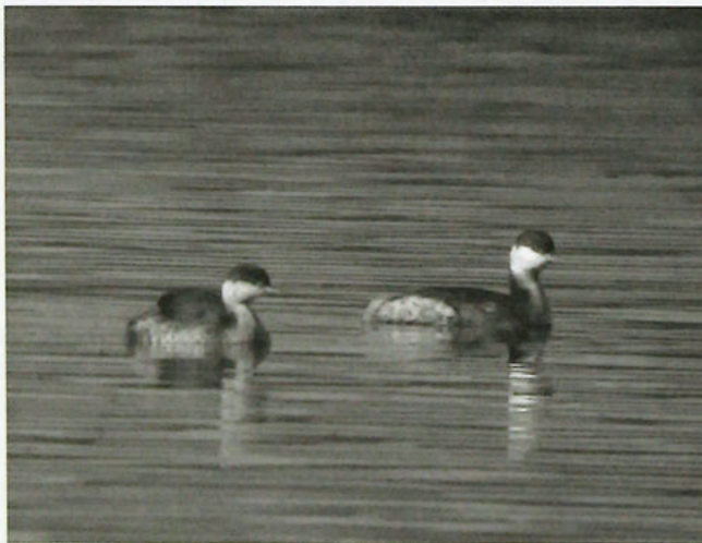
Two Horned Grebes float in the water at Saylorville.