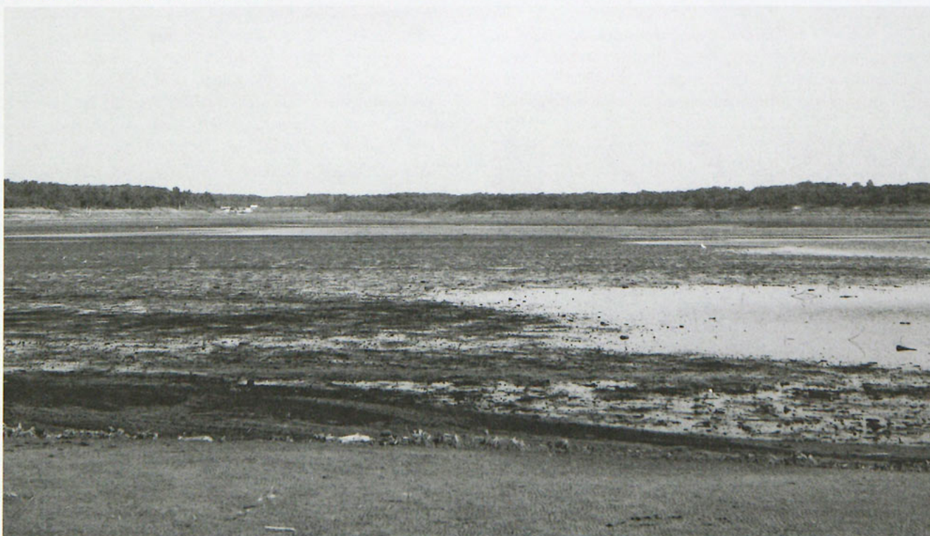
Jester Park flats, at the north end of Saylorville Reservoir.