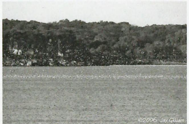
In the fall, gulls gather by the thousands at the large reservoirs.