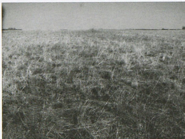
Typical disturbed, shortgrass habitat occurs in the first and usually second season of restored grassland areas. The section above occurred in central Kossuth County in 2006, and produced multiple flocks of Smith's Longspur in the fall.