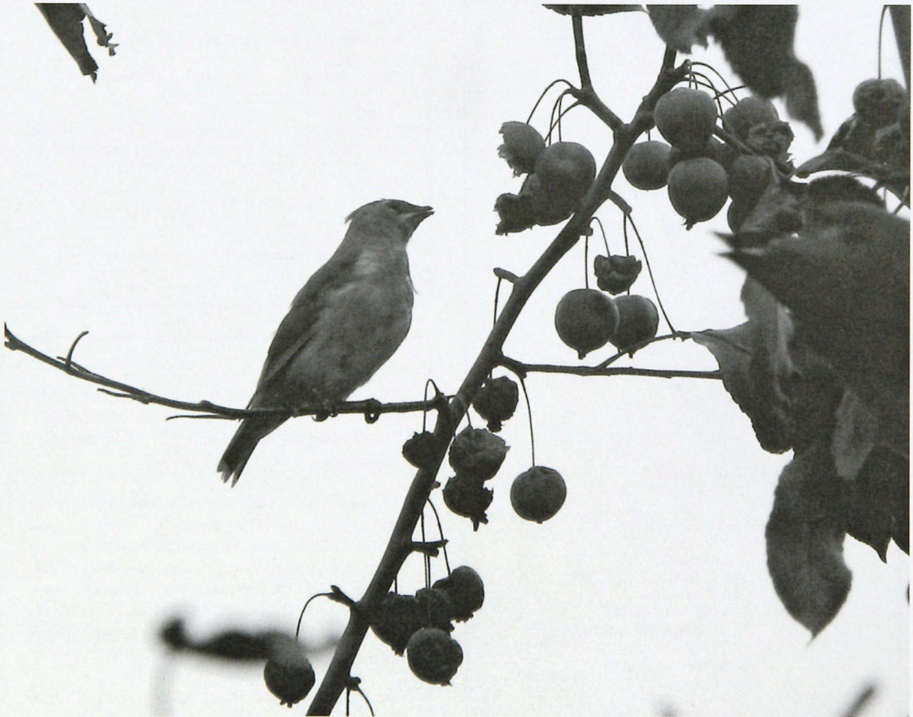
Autumn: the season of plenty. With food sources abundant and bird populations peaking, it's a great time for birders to get out and find what they are looking for. Above, a juvenile Cedar Waxwing feeds on crab apples.