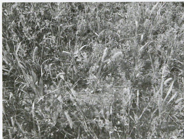
The current composition of grass on 40 acres south of B55 at the Union Hills complex in Cerro Gordo County is short with frequent bare patches of dirt. Grasses are less than knee-high, and foxtail is an abundant constituent of the mix.