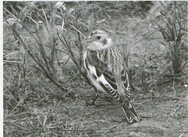
The first Snow Buntings of the season often appear along the shore of Saylorville Reservoir.