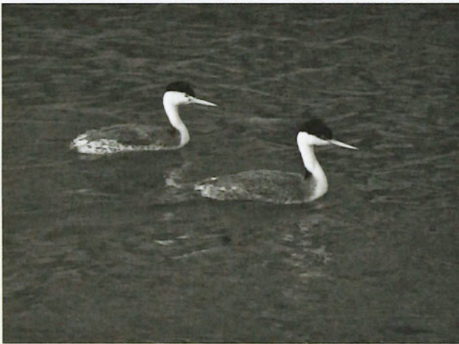
Six grebes occur in Iowa, and the large reservoirs are a good place to look for them in migration. This incredible side-by-side photo of a Clark's Grebe and Western Grebe was taken by Stephen Dinsmore.