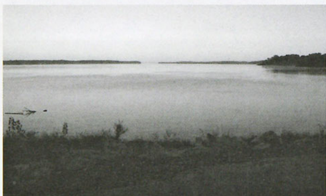
Red Rock Reservoir.

The late fall dates will allow us to look for grebes, loons, gulls, ducks and other interesting birds at both Saylorville Lake and Lake Red Rock . Lunch will be on your own on Saturday in order to allow field trip groups to stay in the field somewhat longer than usual. The drive, particularly to and from Red Rock will be a bit longer than the usual field trip drives.