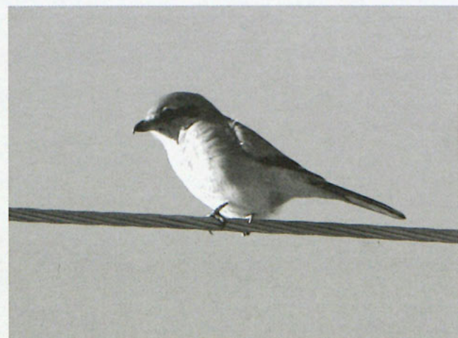
Northern Shrikes usually arrive in late October.