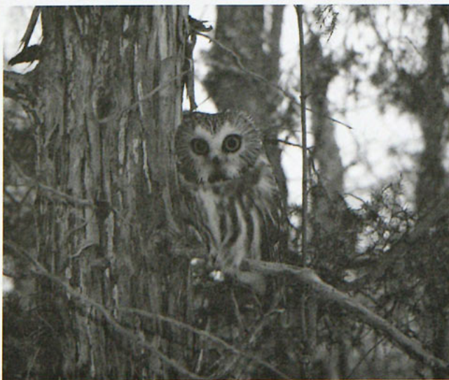
Northern Saw-whet Owls arrive in October.

Of course, in addition to casual and accidental species showing up in the fall, many rare regulars and seasonal regulars begin to appear too. Gulls begin to gather at the large reservoirs, and along the major rivers. Smith's Longspurs