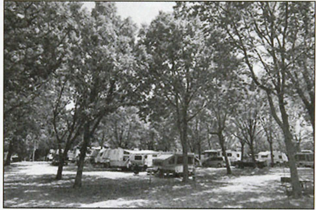
Swan Lake Campground.

* Lunch will be in the field Saturday allowing field trip groups to stay out somewhat longer than usual. We plan to be back for the afternoon program which will begin around 1:15P.M.