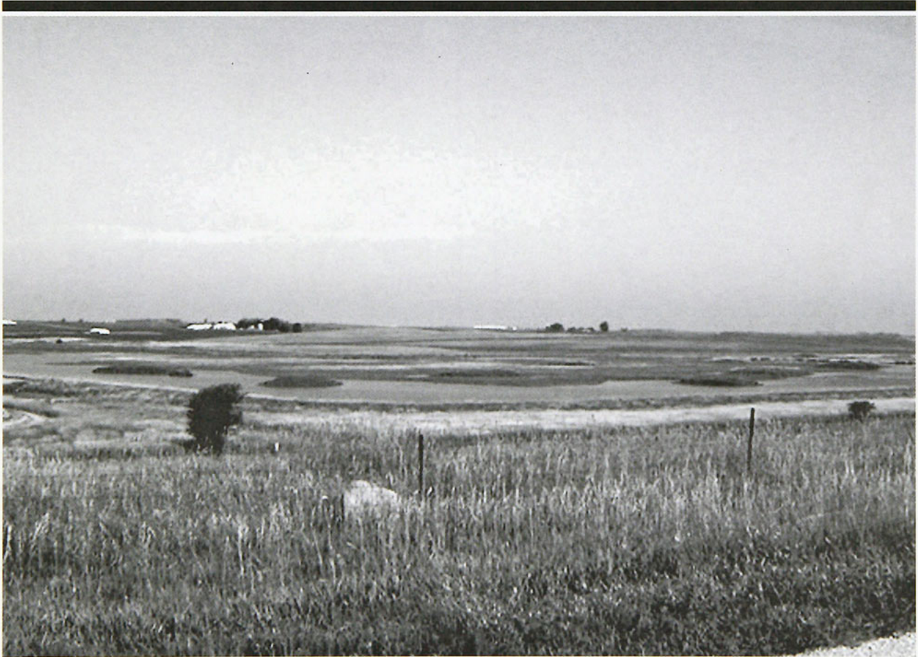
Dunbar Slough, Hunter Tract.