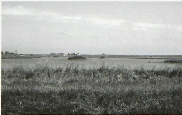
Dunbar Slough, west pond.