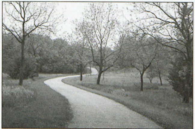
Swan Lake riding/walking trail.

http://www.carrollcountyconservation.com/areas/Swan_Lake_camp.htm