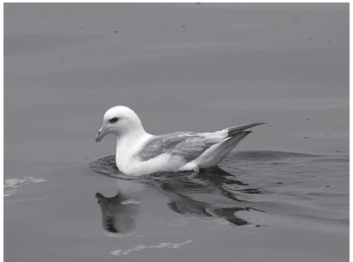
All three morphs of the Northern Fulmar were seen swimming in Monterey Bay.