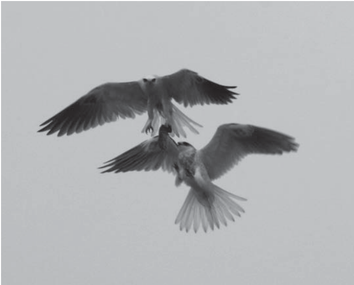
A pair of White-tailed Kites quarrel over a recent catch.

We rolled into Monterey at lunch time and spent the afternoon at the Monterey Aquarium. The view from the deck out over Monterey Bay is spectacular. Brandt’s and Pelagic Cormorants, Heerman’s Gulls, Elegant Terns and several pelagic species could be seen, as well as seals and sea otters. In one section of the building, a Peregrine Falcon hunts pigeons and drops their feet onto a glass ceiling!