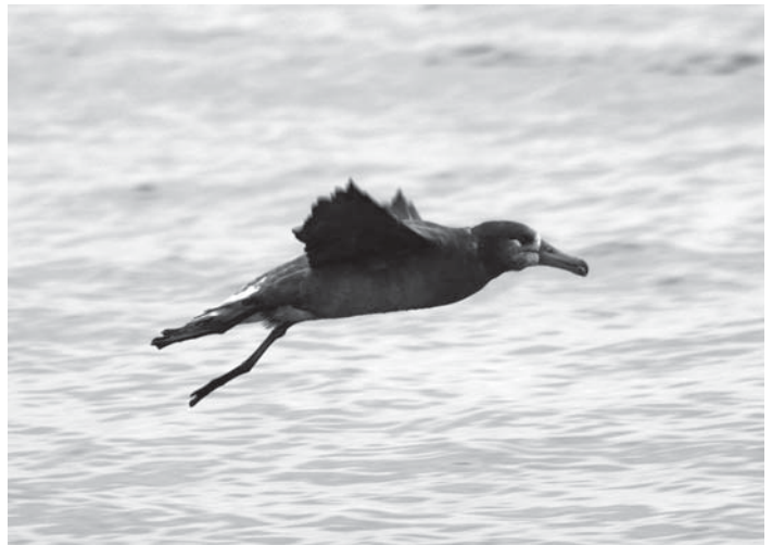
A Black-footed Albatross was photographed from the deck of the Monterey Seabirds tour boat.

A late afternoon excursion to Los Padres National Forest gave us a calling Northern Pygmy Owl. In the fading light, Mountain Quail ran in front of the lead van. Dick lost a glove in the excitement and only a few of the group got diagnostic looks. Luckily, the next morning we found the flock moving down the hillside in good light. And Dick found his glove.