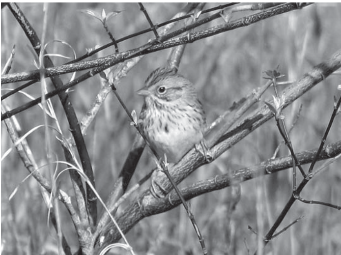
Photos of winter Lincoln's Sparrow would help confirm a rare presence during that season.

Lincoln's Sparrow: any winter report between mid-Nov and mid-Apr. This species is reported almost annually in winter, and frequently on one or more CBCs. In my years of editing the CBC report, I never once received a photo of one, nor am I aware of any winter photos for Iowa. Photographs are badly needed to confirm that some of these aren't juvenile Song Sparrows.