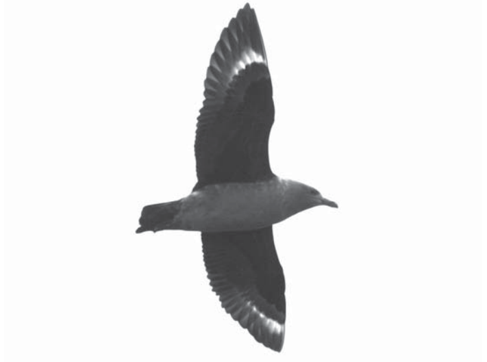
South Polar Skua.

In Monterey for several days, we spent a lot of time working Asilomar State Beach, including Point Pinos Seashore Park. We found Glaucous-winged Gull, Whimbrel, Black Oystercatcher, Black Turnstone, Surfbird and the shorebird whose name I most love to say, Wandering Tattler.