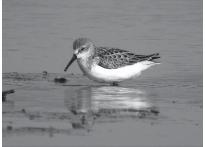
Western Sandpiper in spring is very rare in Iowa, and occurrences should be documented with photos.

Fall Empidonax: each fall there are dozens of reports to the species level, many without any details on how the bird was identified. We desperately need high quality photographs (or banding data) to better understand the timing of migration for each species in fall. I suspect there is a temptation to assume most are the "default" species, Least Flycatcher, which may not be correct. Unless an individual is singing, or captured, or seen extremely well, most are probably best left unidentified.