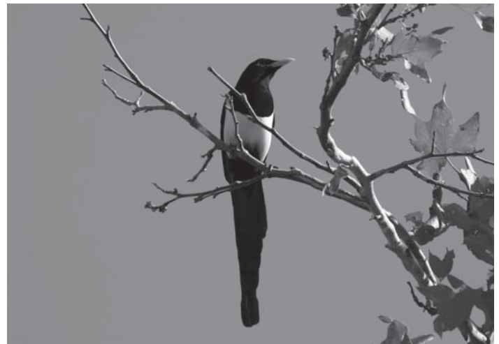
Yellow-billed Magpies were numerous.

Bolinas Lagoon had a variety of shorebirds and water birds, and various locations at Point Reyes National Seashore gave us Black-throated Gray Warbler, Golden-crowned Sparrow, California Towhee, Anna's Hummingbird, great looks at a pair of Wrentits and our first encounter with a flock of seventeen Bushtits. We saw Bushtits on four of the ten days on the tour, and the count was always seventeen birds. Go figure.