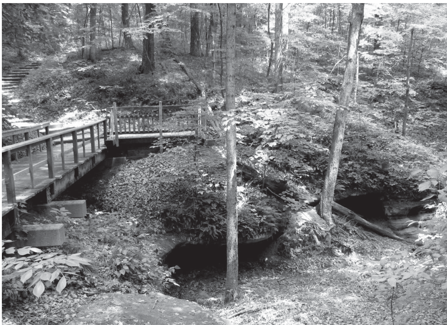
Morning field trips at the spring meeting will include Wildcat Den State Park in Muscatine County.