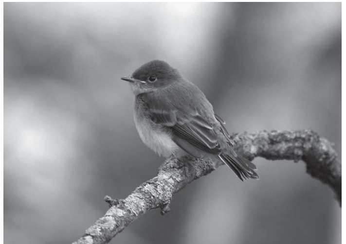
Which Empidonax flycatcher is this? Stubby bill, big head, short wing projection - could be a Least. Actually, it's a juvenile Phoebe.

Fall Empidonax: each fall there are dozens of reports to the species level, many without any details on how the bird was identified. We desperately need high quality photographs (or banding data) to better understand the timing of migration for each species in fall. I suspect there is a temptation to assume most are the "default" species, Least Flycatcher, which may not be correct. Unless an individual is singing, or captured, or seen extremely well, most are probably best left unidentified.