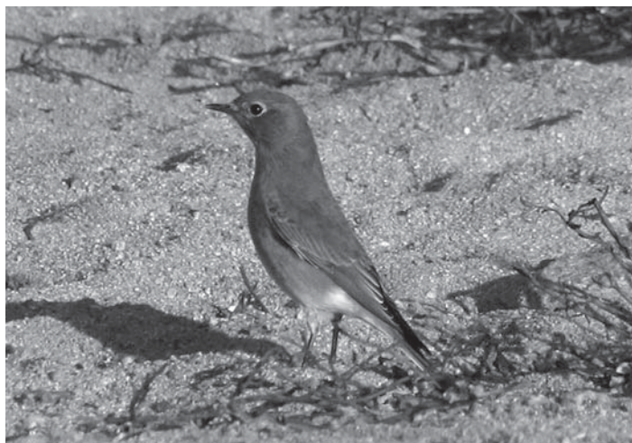
A Mountain Bluebird found on Point Pinos Beach was only the third record for Monterey County.

The bluebird discovery happened not only to be on the beach where John Denver's fatal plane crash occurred, but also on the anniversary of his death. As I was leaving San Francisco on a jet plane, I looked back on a birding tour where the sunshine almost always made me high. It was very interesting to visit California, but I thank God I'm a country boy!