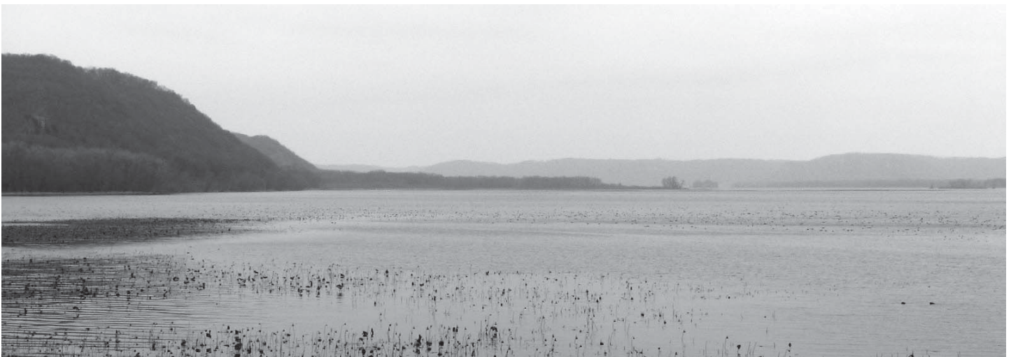
The Mighty Mississippi.

6:00 A.M. Breakfast 7:00 A.M. Field trips depart 12:00 Noon Field trips return Lunch Final compilation