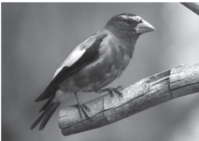
Evening Grosbeak, Evergreen, Colorado, 2007.

Famous for their bright colors and voracious appetites, Evening Grosbeaks were a winter highlight for people who had them visit their feeders. The events of recent years suggest that Evening Grosbeaks might not return to Iowa, at least in the numbers observed in the past. And, as for other species, global climate change has been proposed as another concern. Some climate change models predict that balsam fir, an important tree species for Evening Grosbeaks in the northeastern United States, will gradually retreat into Canada. As is commonly said, only time will tell.