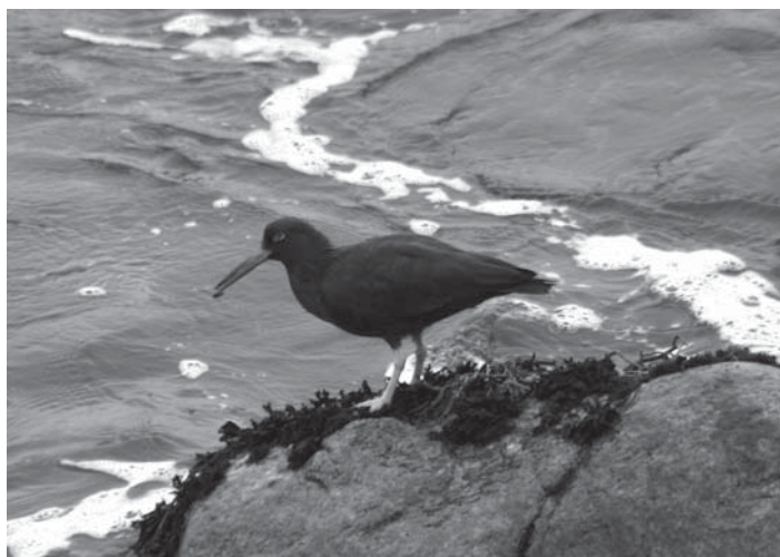
Black Oystercatchers were found along Asilomar State Beach.

Since 1997, a total of 228 Ospreys have been released at 11 sites in Iowa. Since 2003, 52 wild Ospreys have been produced at 24 successful nesting sites.