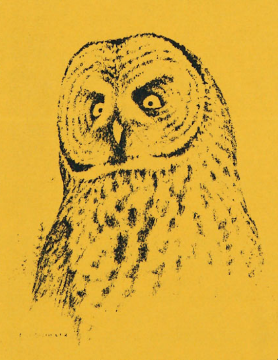
May 18 - 20, 1990 La Crosse, Wisconsin

followed the Mississippi south, with frequent birding stops, to Wyalusing State Park at the mouth of the Wisconsin River. where the afternoon and evening were birding. spent Ruffed Grouse were a highlight. Friday morning dawned much quieter, with clear skies. Once again, birders could hear warblers! At Yellow River Forest in northeast Iowa, the group split up in several directions. On reconvening for lunch, an impressive warbler list