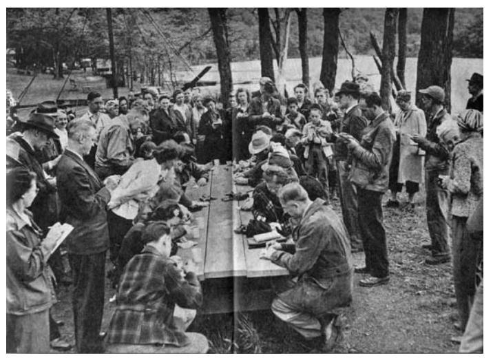
24th Annual Iowa Ornithologists' Union Meeting, Mt. Vernon, Iowa, Bird Tally, May 5, 1946.

Our Flickr site allows us to view our history from anywhere in the world without the need of visiting our archives in Ames. Remember, this site is only as good as what our members contribute.