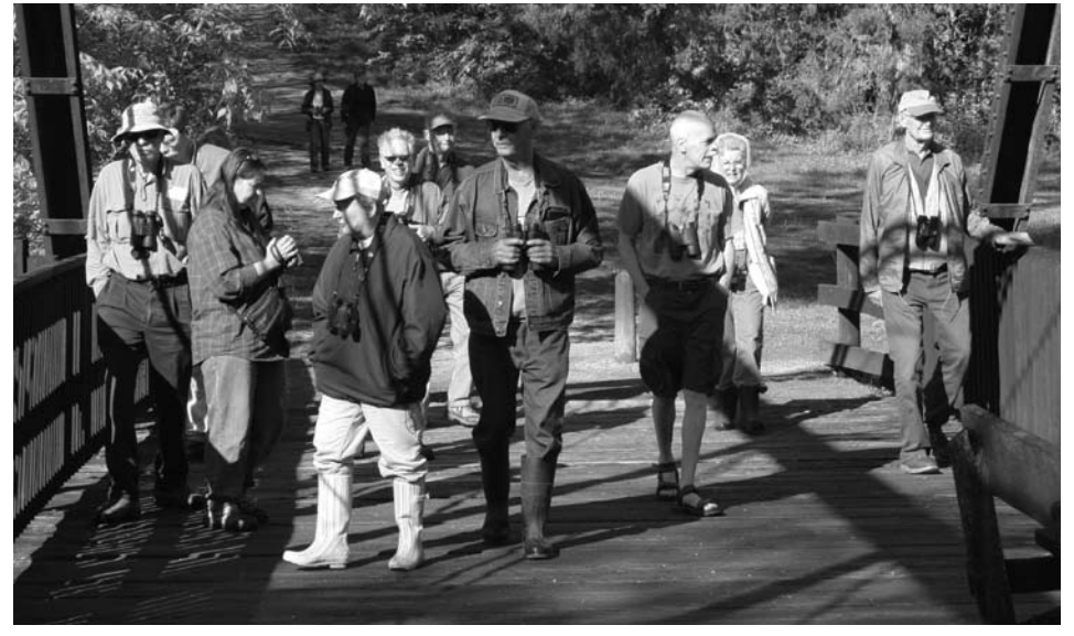
Checking out the historic sites at Wildcat Den State Park.