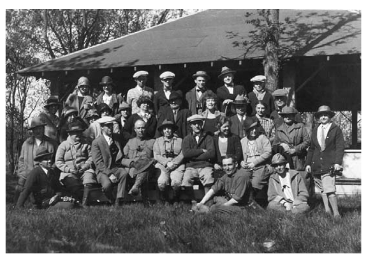
Third Annual IOU Meeting, Atlantic, Iowa, May 14-15, 1926.