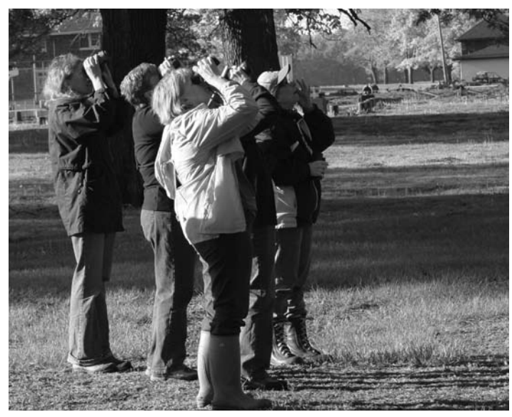
Field trip participants checking out a cooperative Blue-winged Warbler at Credit Island.

Yellow-rumped Warbler Black-throated Green Warbler Yellow-throated Warbler Palm Warbler Cerulean Warbler Black-and-white Warbler American Redstart Prothonotary Warbler Worm-eating Warbler Ovenbird Northern Waterthrush Louisiana Waterthrush Kentucky Warbler Common Yellowthroat Hooded Warbler Summer Tanager Scarlet Tanager Eastern Towhee Chipping Sparrow Clay-colored Sparrow Field Sparrow Vesper Sparrow Lark Sparrow Savannah Sparrow Grasshopper Sparrow Henslow's Sparrow Song Sparrow Lincoln's Sparrow Swamp Sparrow White-throated Sparrow White-crowned Sparrow Northern Cardinal Rose-breasted Grosbeak Indigo Bunting Dickcissel Bobolink Red-winged Blackbird Eastern Meadowlark Western Meadowlark Common Grackle Brown-headed Cowbird Baltimore Oriole House Finch American Goldfinch House Sparrow Eurasian Tree Sparrow