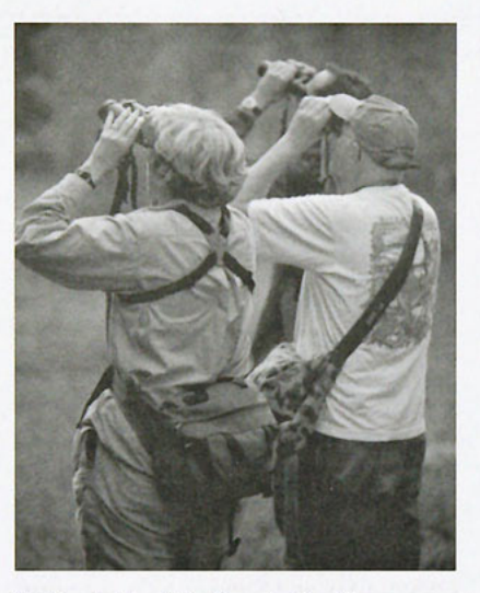
Birding Ledges SP.