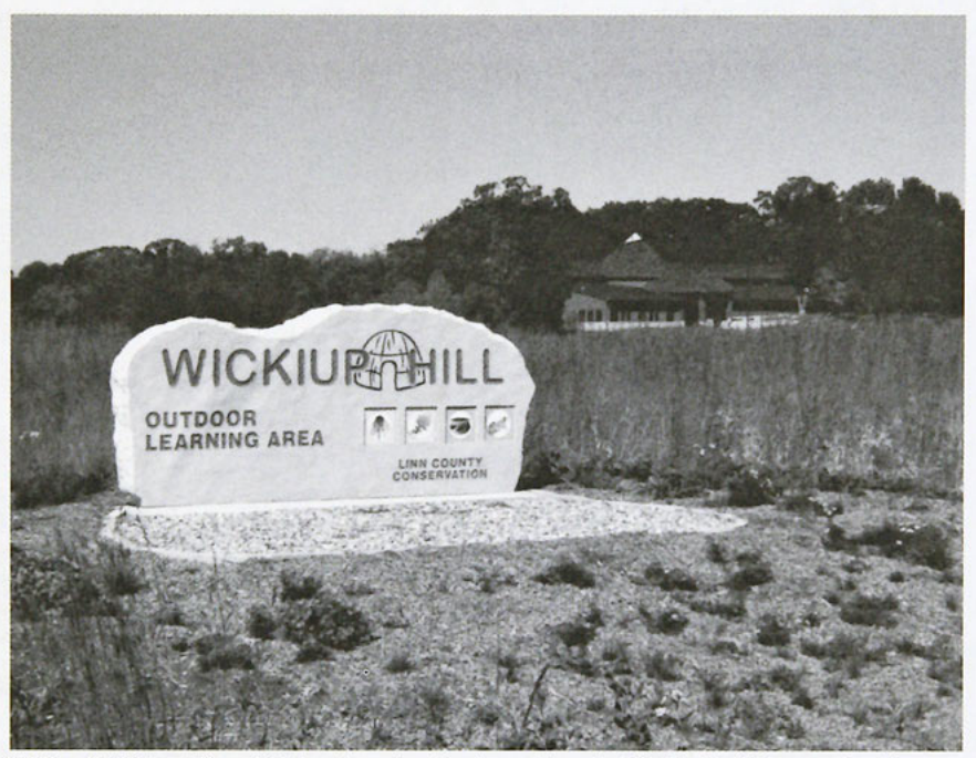
Wikiup Hill Natural Area Outdoor Learning Center northwest of Cedar Rapids served as the central gathering place for the 2004 IOU Fall Meeting. The Wikiup Hill Natural Area is located along the Cedar River Greenbelt. Members of the Iowa City Bird Club hosted the event.

Field trips found a total of 152 species of birds, amazing given that conditions were generally quiet, with