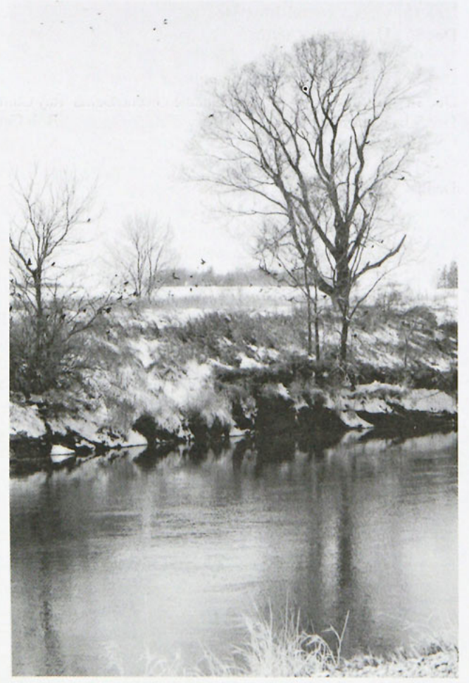
Winter birds along the Shellrock River, Worth Co.