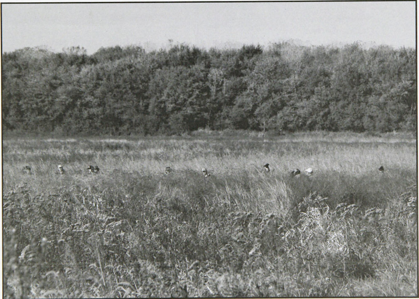
Meeting attendees search for Ammodramus sparrows in the tall grass at Buckshot Lake, Sedan Bottoms. How many birders can you count?