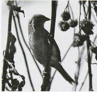
A cooperative LeConte's Sparrow, one of the signature species of the Fall meeting in Appanoose County.

Canada Goose Wood Duck Gadwall American Wigeon Mallard Blue-winged Teal Northern Shoveler Northern Pintail Green-winged Teal Ring-necked Duck Lesser Scaup Hooded Merganser Ruddy Duck Ring-necked Pheasant Wild Turkey Northern Bobwhite Pied-billed Grebe Horned Grebe Western Grebe American White Pelican Double-crested Cormorant Great Blue Heron Great Egret Turkey Vulture Bald Eagle Northern Harrier Sharp-shinned Hawk Cooper's Hawk Red-tailed Hawk American Kestrel Merlin Virginia Rail Sora American Coot Semipalmated Plover Killdeer Lesser Yellowlegs Sanderling Least Sandpiper Dunlin Wilson's Snipe Franklin's Gull Bonaparte's Gull Ring-billed Gull Herring Gull Common Tern Forster's Tern Rock Pigeon Eurasian Collared-Dove Mourning Dove Eastern Screech-Owl Great Horned Owl Barred Owl Chimney Swift Belted Kingfisher Red-headed Woodpecker Red-bellied Woodpecker Yellow-bellied Sapsucker Downy Woodpecker Hairy Woodpecker Northern Flicker Pileated Woodpecker Eastern Phoebe Blue-headed Vireo Blue Jay American Crow Horned Lark Tree Swallow