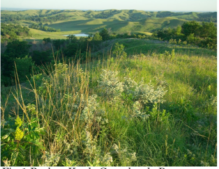
Fig.1 Broken Kettle Grasslands Preserve, Plymouth

Broken Kettle Grasslands Preserve, protected and managed by The Nature Conservancy, contains the largest contiguous remnant prairie in the state and is an excellent location for birding. The preserve encompasses over 1500 ha and features a bison herd of up to 200 animals. It is located at the northern terminus of the Loess Hills in Plymouth County, about 6.5 km south of Westfield, IA on Highway