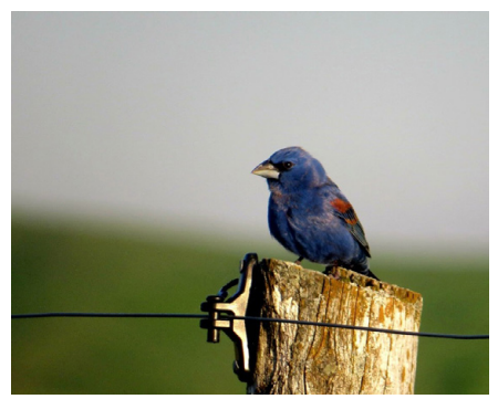
Blue Grosbeak on the bison fence, Broken Kettle Grasslands Preserve, Plymouth, 23 May 2024.

schedule. The camp provides a change of scenery as it is centered around a heavily wooded and rugged creek valley. Species including Kentucky Warbler, Louisiana Waterthrush, Red-shouldered Hawk, and Pileated Woodpeckers are at the edge of their Great Plains range here. Blue Grosbeaks and Bell's Vireo are often observed along the entrance road, and Field Sparrows, Eastern Towhee, and other woodland/grassland ecotone-loving species are common here. A map of the hiking trails (maintained by the Girls Scouts) is available to view at the parking lot kiosk, or paper copies are available in the nearby picnic shelter.