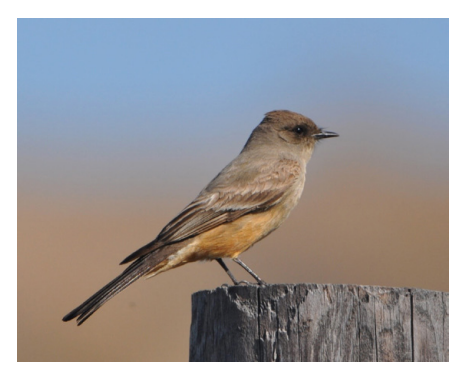
Say's Phoebe, Broken Kettle Grasslands Preserve, Plymouth, 10 April 2024.

Office and Visitor Center: Stop into the visitor center at 24764 Highway 12, Westfield, IA, to learn more about the preserve and to delve deeper into the natural history of the grasslands. There are a couple of weedy, in-progress prairie restorations south of the headquarters driveway and around the visitor center. These are excellent spots to check for migrant sparrows, including Harris's Sparrows, LeConte's Sparrows, and even Spotted Towhees. Rough-legged Hawks and Northern Harrier are often seen hunting the prairie in this area during migration and winter. When the Big Sioux River floods, as was the case in the summer of 2024, displaced Least Terns can sometimes occur along Highway 12 near the visitor center.