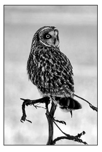
Figure 1. Short-eared Owl, Owego Wetlands Complex, Woodbury, October 2006.

In pre-settlement times, the floodplain stretched westward from the Loess Hills to the hills on the west of the Missouri River. This low-lying area was blessed with frequent flooding. Spring brought rampaging water from the Missouri River and swollen tributaries from the Elk River down to the Soldier River that spilled onto the level, poorly drained plain, which assured the water crucial for this vast flatland to support tall grass prairies, sedge meadows, and cattail marshes. These palustrine wetlands, with their emergent vegetation were the stop over for countless migrating avian species as