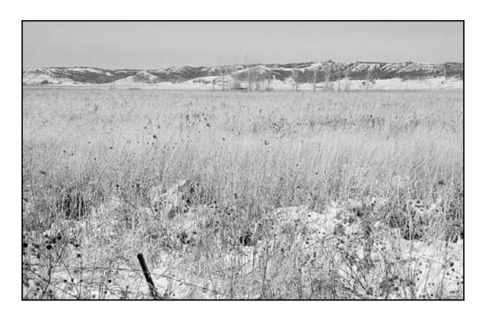
Figure 2. Mid-fall, Owego Wetlands Complex, Woodbury, October 2006.

landowners followed suit. Because none of the owners desired to retain ownership of their property, the WCCB was able to acquire title by residual value to a block of land a little over two square miles in area. The chance to create a major public wetland habitat was a reality. Most wetland development and enhancement work is planned and funded through