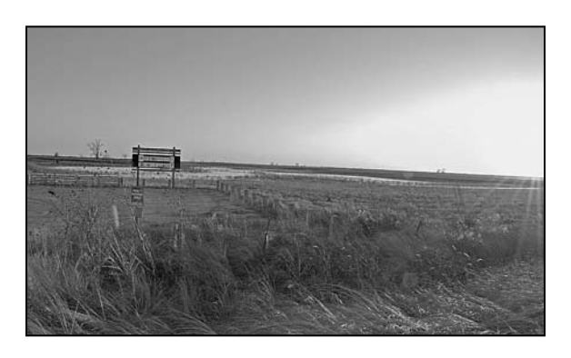
Figure 3. Winter, Owego Wetlands Complex, Woodbury, November 2006.

Spring migration brings multitudes of waterfowl, including most of our ducks and geese. Large concentrations of Northern Pintail and Blue-winged and Green-winged Teal can be seen. A great variety of shorebirds have been seen including Hudsonian and Marbled Godwit, American Golden and Black-bellied Plover, Dunlin, Willet, Black-crowned Night-Heron, American Avocet, Great and Cattle Egret, dowitchers, phalaropes, and sandpipers. The latter three can occur in large numbers. At the old town site, spring warblers, thrushes, and other songbirds can be seen. A pair of Great Horned Owls fledged three young there