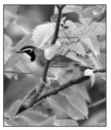
Figure 5. The Kentucky Warbler (Oporornis formosus) is among several southeastern species to look for at Brookside Park in spring. Photographed at the Croton Unit of Shimek State Forest, Lee, 21 May 2005 by Jay Gilliam, Norwalk, IA.

north. However, many are likely over-migrants, or birds that have traveled beyond the usual known limits of their nesting range. Although most of these species are not guaranteed in a given spring at Brookside, suitable fallout conditions frequently produce one or two of the group. As in much of the state, Kentucky Warbler, Hooded Warbler, and Summer Tanager are particularly strong over-migrants that are currently the most likely to be found. Southeastern species are also seen at Brookside in fall, especially hatch-year birds, but not nearly as often. Again, the riparian woodland in the northern half of the park is the place to seek out these birds during migration.