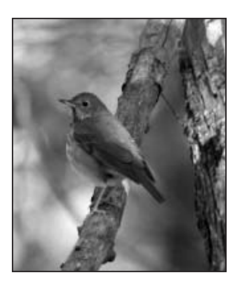
Figure 4. Positioned as an urban oasis, Brookside Park attracts considerable numbers of migrant songbirds. Hermit Thrush (Catharus guttatus) photographed at Saylorville Reservoir, Polk, 16 October 2004, by Jay Gilliam, Norwalk, IA.