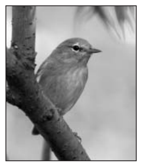
Figure 3. During spring and fall, Brookside Park comes alive with neotropical migrants. Orange-crowned Warbler (Vermivora celata) at White Oak Conservation Area, Mahaska, 16 October 2005.

creek-side route. As always, please stay on these woodland trails to help ensure a healthy understory. Squaw Creek's growing white-tailed deer herds will take care of the trampling for us.