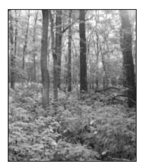
Figure 2. The inner woodland of Brookside Park, 9 September 2005.