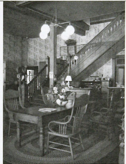
The lobby, at Hotel Manning.

There are camping sites (vehicle and tent) in Lacey-Keosauqua State Park. The park is located just across the Des Moines River south of Keosauqua. Costs are $16 per day for sites with electricity and $11 per day for sites without electricity.