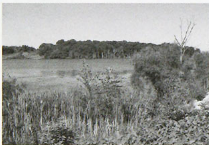
Lake Sugema, Van Buren County.

The hotel complex is located on the Des Moines River at the south edge of town.