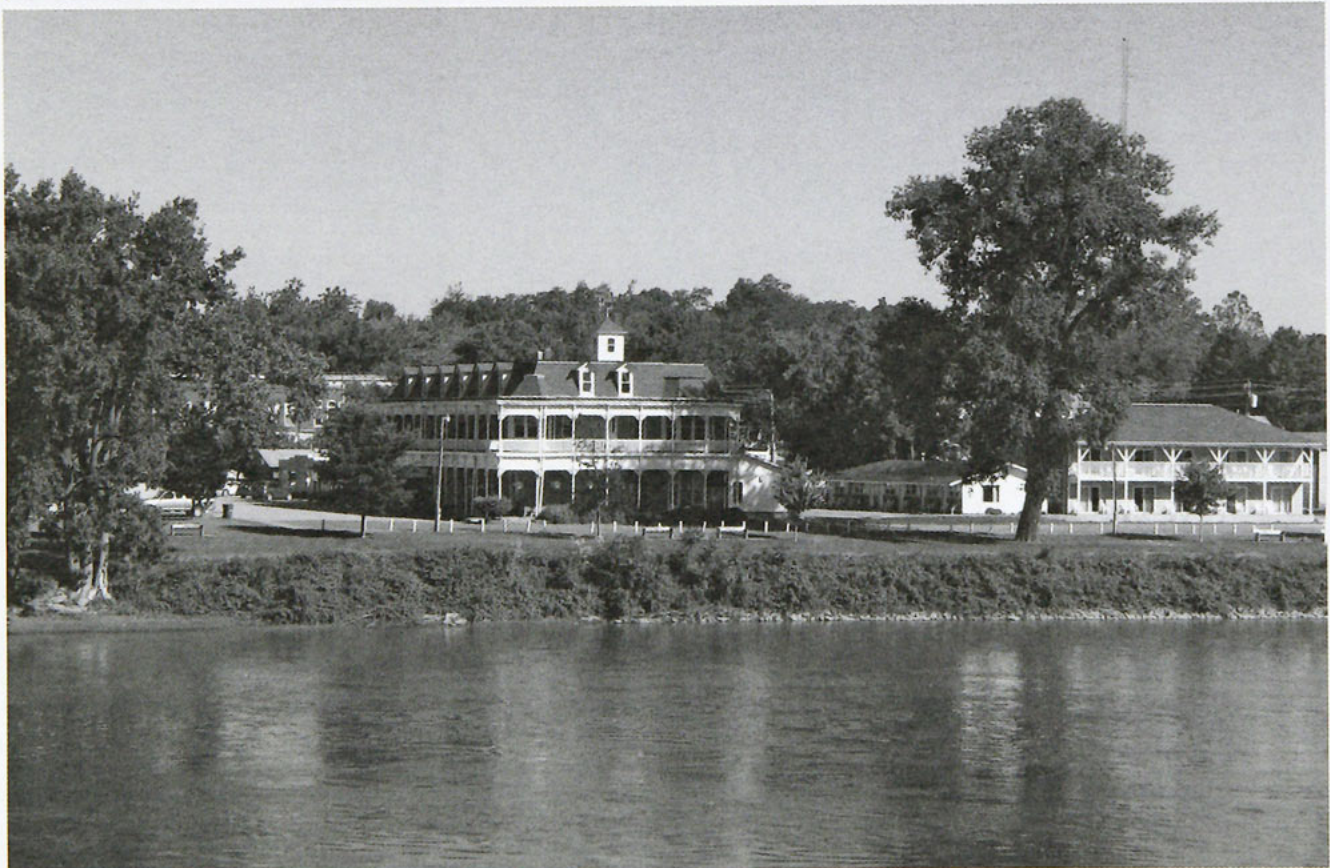
The Hotel Manning sits along the Des Moines River in Van Buren County.