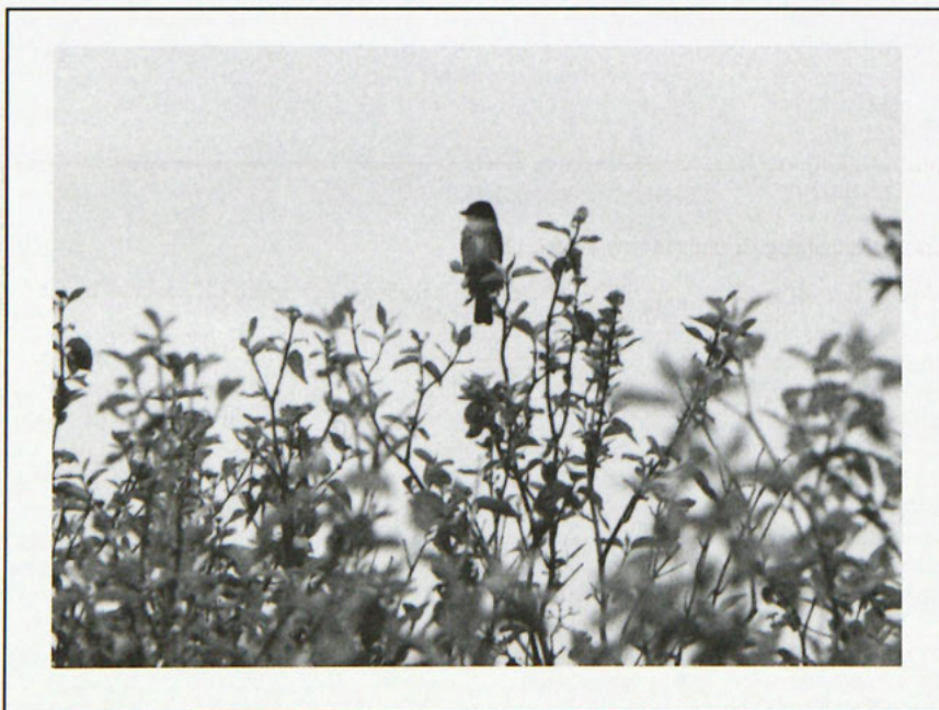
An Olive-sided Flycatcher migrates through the Lime Creek Conservation Area in Cerro Gordo County in Spring, 2004.