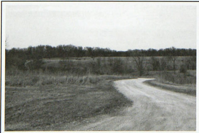
Woodland Mounds Preserve.