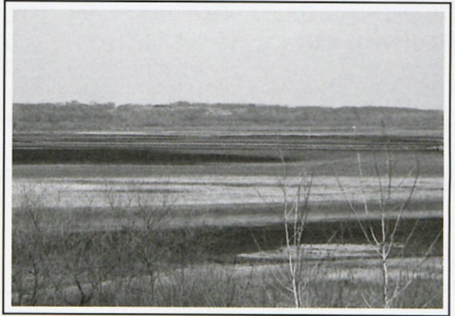
Runnells Overlook.