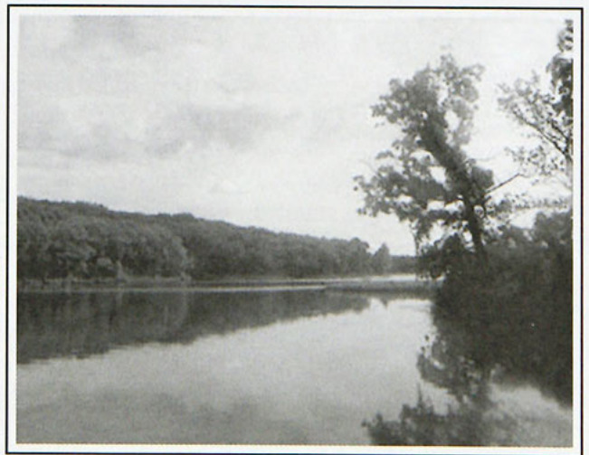
Lake Ahquabi. Iowa State University Limnology Laboratory.