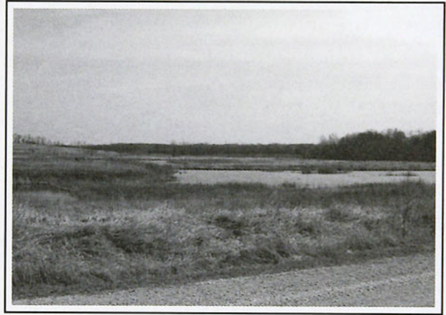
Cumming Wetlands.