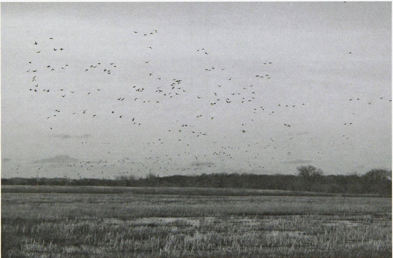
Banner Wildlife Area wetlands is one of Warren County's premier sites.