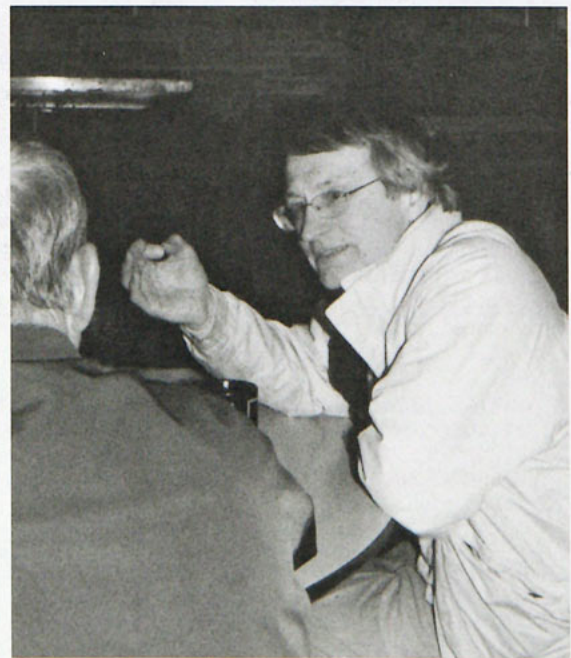
At the IOU Spring Meeting in Ottumwa.