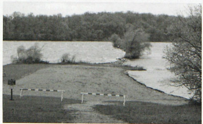
McIntosh State Park staff restricted access to the beach.

We thank the McIntosh State Park staff for temporarily setting aside a portion of the park as critical habitat.