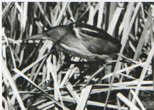
Least Bittern is a rare summer resident in Iowa. This one was photographed in Cerro Gordo County by Rita Goranson, May, 2002.

Rarities are seldom found during the summer season but birders can still find lots of interesting birds. Late spring migrants (shorebirds and warblers) often linger into June, and many shorebirds are well on their way south in July. Of particular interest are nesting records of many of Iowa's less-common species (e.g., Loggerhead Shrike, Upland Sandpiper) or species that have limited nesting ranges in Iowa (e.g., Hooded Warbler, Winter Wren, etc). With the Important Bird Areas program now underway, data collected to solidify the nomination of an area for IBA status may also be great information to submit for the summer field reports.