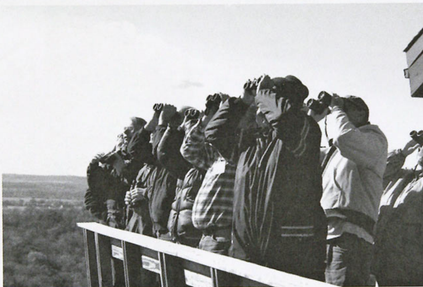
Hawkwatching from the deck of the Hitchcock lodge was a popular event.

Saturday evening's speaker was Ty Smedes with a spectacular slide show of the birds and Mammals of East Africa. Sunday morning, 19 people at-