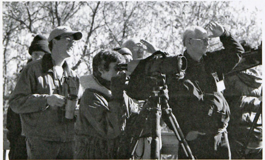
Birding the Loess Hills.