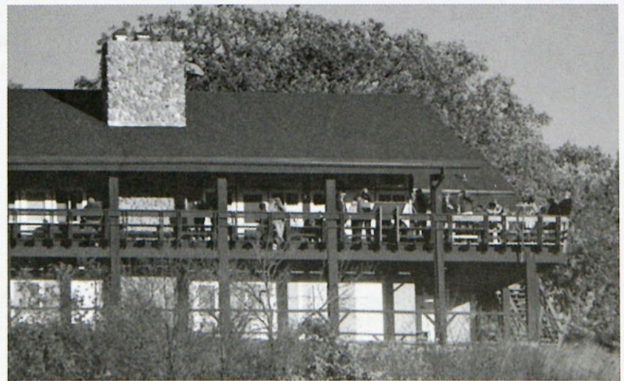
The Hitchcock Nature Area lodge.