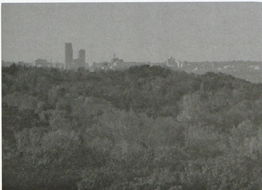
Across the wooded hills, the Omaha/Council Bluffs metro area lies within sight of the Hitchcock lodge deck.

After lunch, the compilation was held. Members tallied 102 species including Swainson's Hawk, Merlin and Northern Goshawk. Not bad considering the slow start on Sunday. A special thanks to all those who volunteered to help and especially to the Hitchcock staff for all their advice and help.