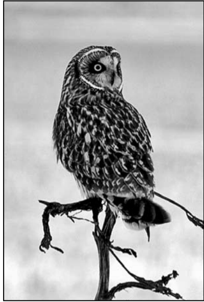
Figure 1. Short-eared Owl, Owego Wetlands Complex, Woodbury, October 2006.

But settlement changed the landscape when the Missouri River was dammed and channelized, tributaries from the hills were ditched and diverted, and the floodplain was drained and cultivated. The wetlands disappeared, and along with them, the birds and other wildlife dependent on wetlands. Gone were a great majority of the nesting waterfowl, secretive rails and American Bittern, ground-nesting Northern Harrier, Short-eared Owl (Figure 1), Greater Prairie-Chicken, Bobolink, and numerous passerines.