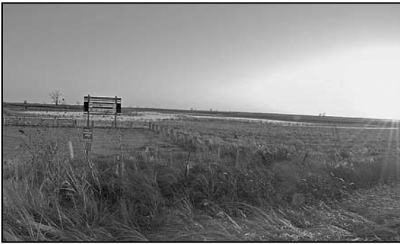
Figure 3. Winter, Owego Wetlands Complex, Woodbury, November 2006.

in early 2006. Fall and winter bring Northern Harrier, Short-eared Owl, Rough-legged Hawk, Northern Shrike, Merlin, longspurs, and a wide variety of sparrows.