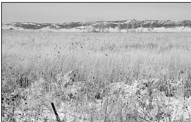
Figure 2. Mid-fall, Owego Wetlands Complex, Woodbury, October 2006.

landowners followed suit. Because none of the owners desired to retain ownership of their property, the WCCB was able to acquire title by residual value to a block of land a little over two square miles in area. The chance to create a major public wetland habitat was a reality. Most wetland development and enhancement work is planned and funded through