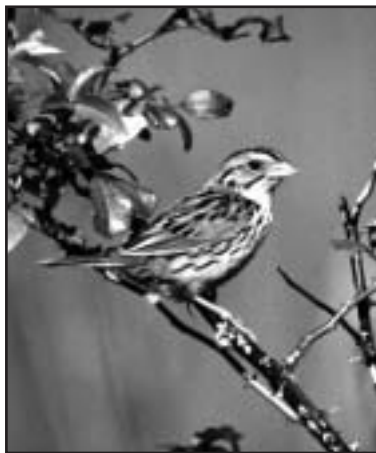
Figure 2. Henslow's Sparrow in Pleasant Creek State Recreation Area, 12 June 2004.

1460 Douglas Ct., Marion, IA 53302-2308 (DurbinJames@mcleodusa.net)